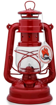
The Lamp for Peace

The largest naval, land and air operation in history will be commemorated on Kirkby Fleetham Green and Village Hall on: Thursday June 6